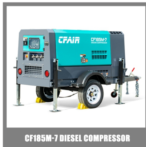
CF185M-7 DIESEL COMPRESSOR